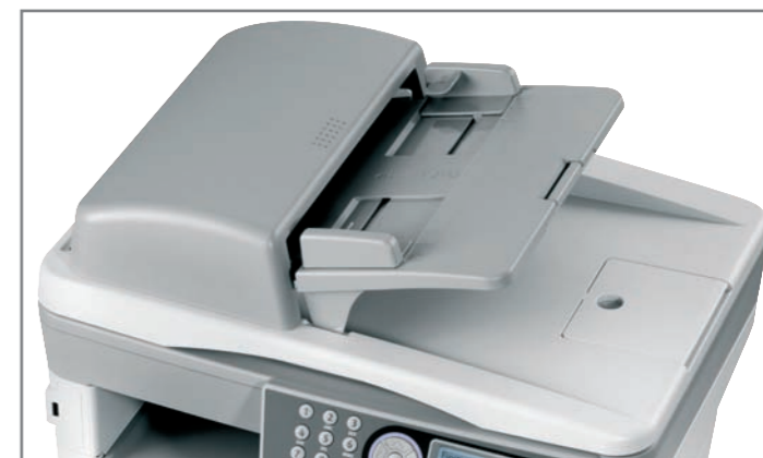
INTUITIVE OPERATOR PANEL to produce copies and enjoy the power of network scanning to the PC