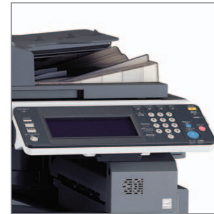
Ergonomic KEYBOARD with LCD screen