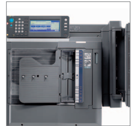
AUTOMATIC 100 sheet PAPER FEEDER