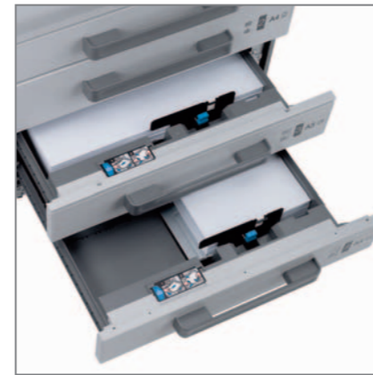
WIDE PAPER RANGE, up to 3350 sheets